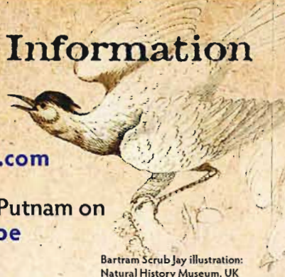
Bartram Scrub Jay illustration: Natural History Museum, UK