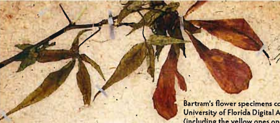
Bartram's flower specimens (including the yellow ones on the front cover)