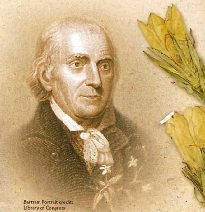
Bartram Portrait