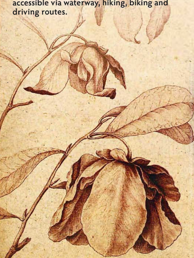
Bartram Paw-Paw illustration: Natural History Museum, UK

The Bartram Trail in Putnam County was formed in order to re-establish the sites of William Bartram's travels in our region and make them accessible via waterway, hiking, biking and driving routes.