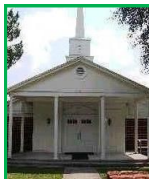
c. 1852 Peniel Baptist Church ♦ 5227 Silver Lake Dr, Palatka Vernacular with drop-lap siding & corner boards, common to rural churches during this era. Best noted for the Baptism & Ordination of Evangelist Billy Graham, who conducted services on several occasions in 1938-39.