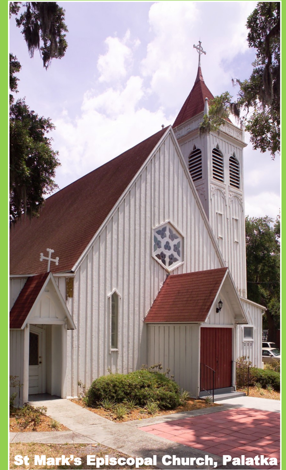
St Mark's Episcopal Church, Palatka