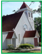
c. 1854 St. Mark's Episcopal Church ♦ 200 Main St, Palatka The oldest religious building in Palatka. Occupied by Union Soldiers during the Civic War.