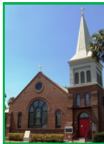
c. 1897 St. Monica's Catholic Church ♦ 114 South 4th St, Palatka 3rd oldest church in St Augustine Diocese. Romanesque Revival style, masonry walls are highlighted by semi-circular arched windows. The fixed stained-glass windows are splendid works of art. A square bell tower supports an inspiring metal shingle-clad spire. Parapets rise on the east & west gables.