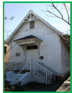
c. 1883 St. Mary's Episcopal Church ♦ 809 St Johns Ave, Palatka Gothic Revival style, features board & batten siding, lancet windows and curvilinear trim at the gable ends.