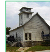
c. 1890 Union Bethel African Methodist Episcopal Church ♦ 200 N Cedar St, Crescent City Services began in 1890, after the building was moved from another site to this location. Nationally renowned labor organizer A. Philip Randolph attended here while his father was the preacher.