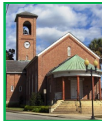
c. 1881 First Presbyterian Church ♦ 121 South 2nd St, Palatka Romanesque Revival style, clock & bell tower topped with a hipped roof.