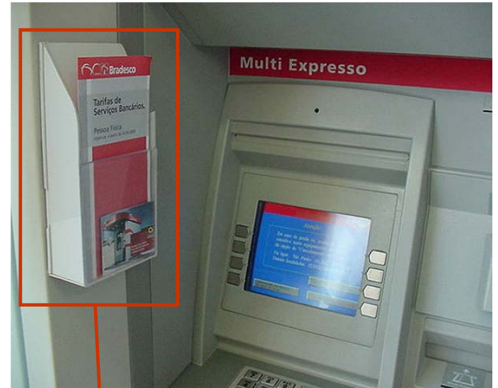
Figure 4B: Wait ... is it really a pamphlet holder?