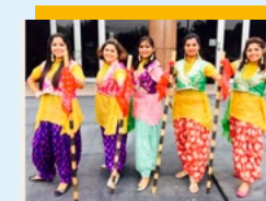
STEPS for DANCING Performance