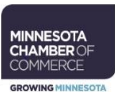
At The State Capital