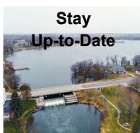
Stay Up-to-Date Follow Us