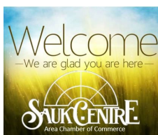
Welcome New Members