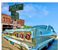
Sinclair Lewis Days Updates