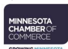
At The State Capital