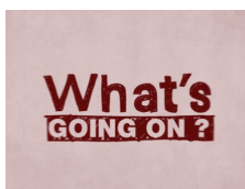
What's Going On?