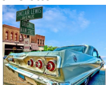
Sinclair Lewis Days Updates