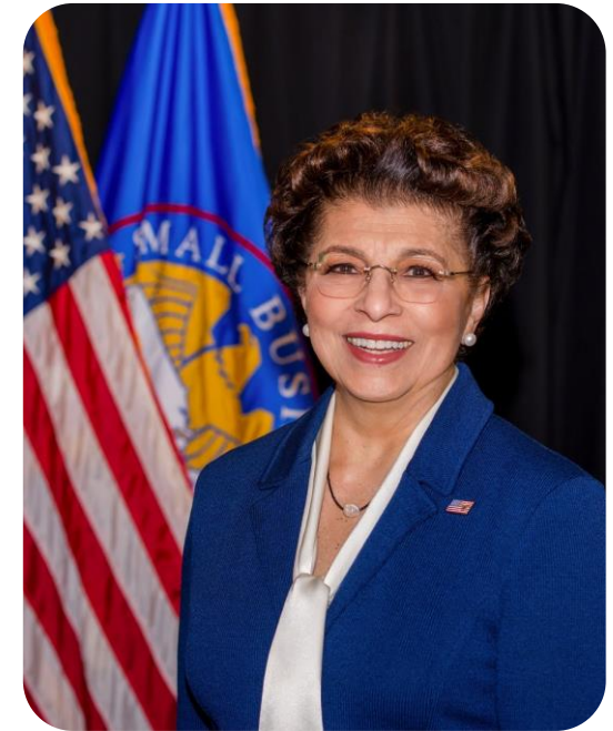
Administrator Jovita Carranza

Upon a request received from a state's or territory's Governor, SBA will issue under its own authority, as provide by the Coronavirus Preparedness and Response Supplement Appropriations Act that was recently signed by the President, an Economic Injury Disaster Loan declaration.