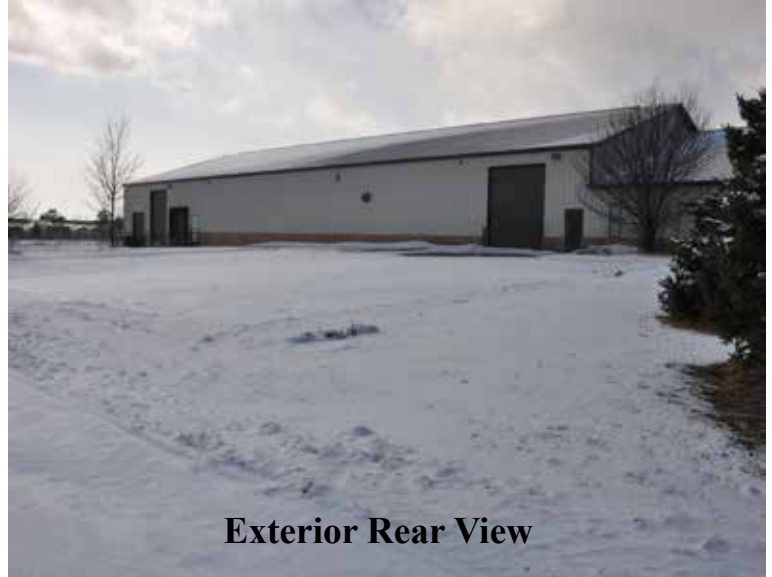
Exterior Rear View