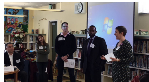
2017-2018 Leadership Institute participants presenting ideas for the class project.