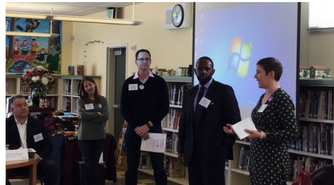
2017-2018 Leadership Institute participants presenting ideas for the class project.