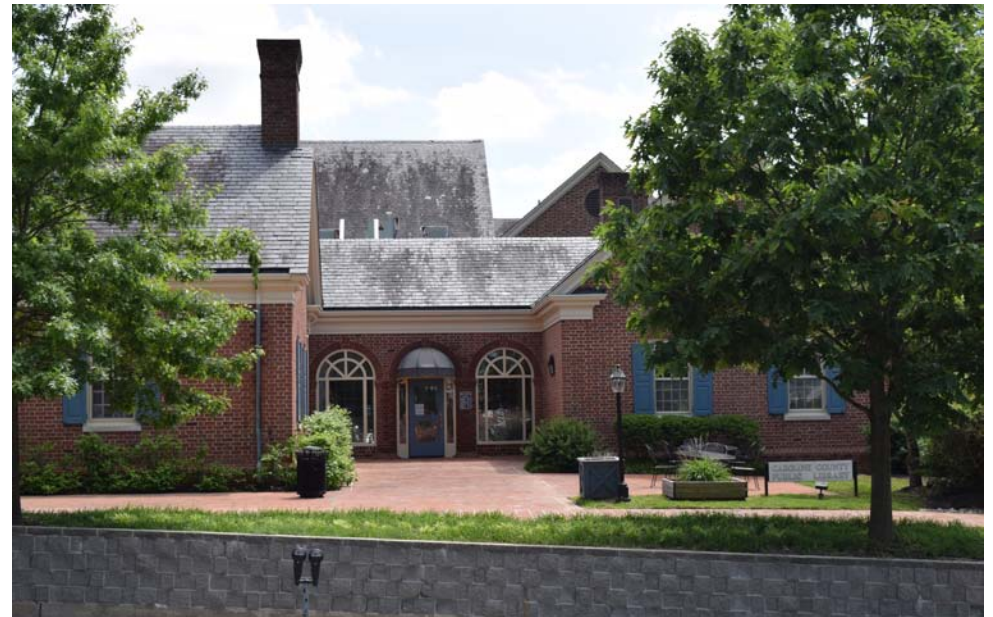
The central branch of Caroline County Public Library is located at 100 Market St., Denton.