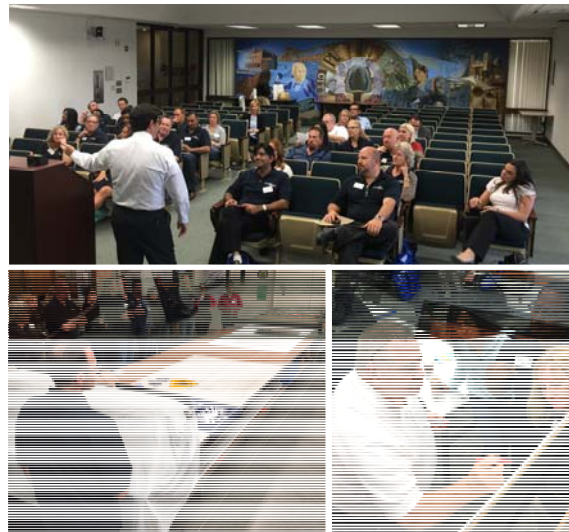
Learn valuable information about the local community.

Applicants chosen for the program will have the unique opportunity to develop their potential for public responsibility. Each session is designed to inform, motivate and challenge the participant. A volunteer community leader designs each session to present issues from various perspectives through the use of panels, tours and individual presentations. The time commitment is one day per month for nine months. Most sessions are held from 8:00 a.m. to 5:00 p.m. Participants are expected to attend all sessions. Those missing more than 2 sessions will not graduate with the present class. However, sessions can be made up the following year.