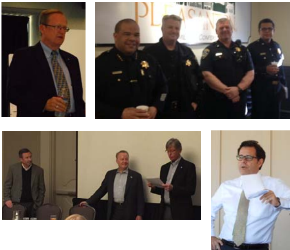
Go behind the scenes with local leaders.

One measure of a dynamic, progressive community is the caliber of leaders and their voluntary contributions to that community. Leadership Pleasanton identifies emerging community leaders and offers them broad exposure to issues considered vital to our community. Leadership Pleasanton is an educational forum in which participants look into the myriad of private businesses, public agencies, nonprofits and elected officials who make up the economic and political environment of Pleasanton. Through these contacts, interactive exercises and field trips, participants expand their leadership skills, knowledge and influence on our community.