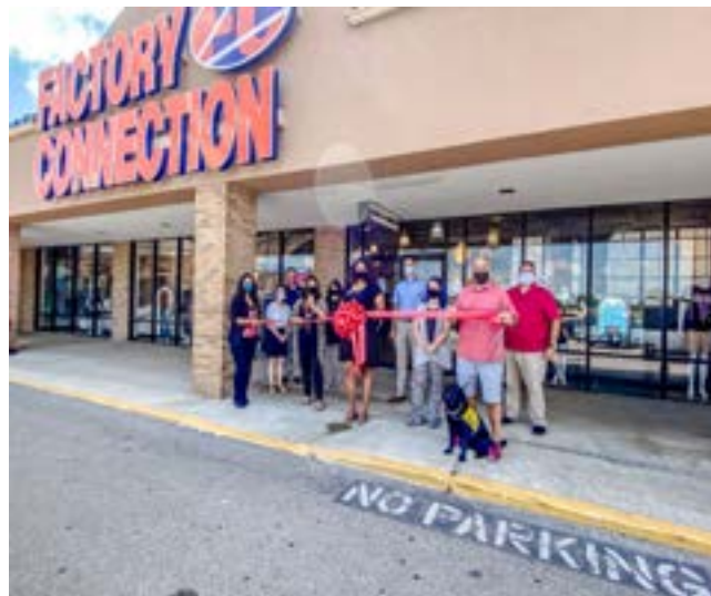
Factory Connection 2111 South Main Street Bellefontaine