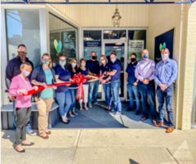
Perscription Bliss 118 North Main Street Bellefontaine