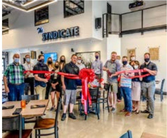
The Syndicate 213 South Main Street Bellefontaine