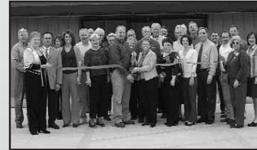
MCKENZIE TILE AND FLOORING 301 S Southeast Loop 323 • Tyler TX 75702 903-596-0346