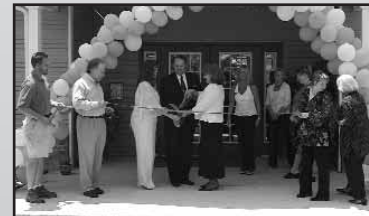
THE PARK AT SHILOH 2911 Shiloh Rd • Tyler TX 75703 903-509-3070