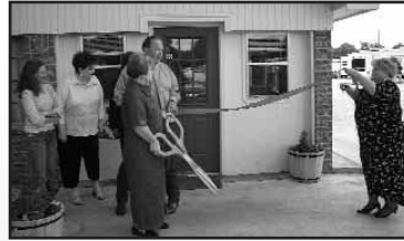
# RV PARK OF TYLER 12421 State Hwy 31 W • Tyler TX 75709 903-597-6966