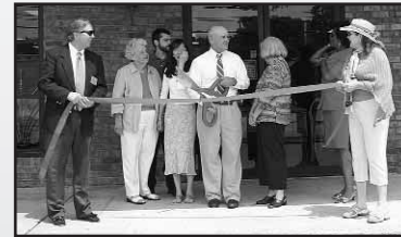
SLEEP SAVVY 3502 S Broadway • Tyler TX 75701 903-509-2337