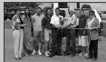
LAMBERT'S WINDOW TINTING AND TRUCK ACCESSORIES 2020 W Southwest Loop 323 • Tyler TX 75701 903-581-5425