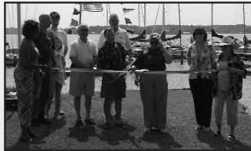
TYLER YACHT CLUB PO Box 130906 • Tyler TX 75713 903-882-2404