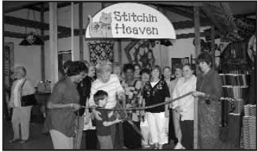
STITCHIN HEAVEN 5201 S Broadway • Tyler TX 75703 903-939-9872