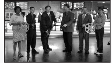
CARMIKE CINEMAS 7415 S. Broadway • Tyler TX 75703 903-939-0260