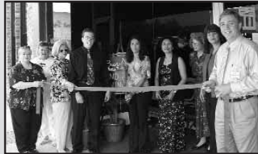
BAAN NITAYA EXOTIC THAI CUISINE 109 E Erwin • Tyler TX 75702 903-535-7850