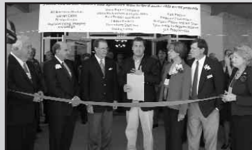
MEALS ON WHEELS MINISTRY 3001 Robertson Rd • Tyler TX 75701 903-593-7385