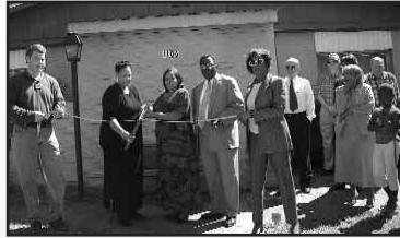
A.D.I.C.T. MINISTRIES 1106 Tresavant • Tyler TX 75702 903-593-4554