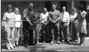
GARY BURTON ENGINEERING INC 14531 Hwy 155 S • Tyler TX 75703 903-561-6984