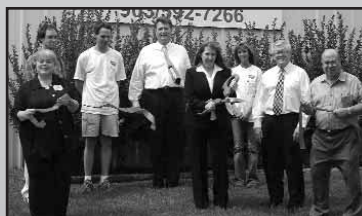
ARCHIVES USA 2948 Specialty Dr • Tyler TX 75707 903-592-7266