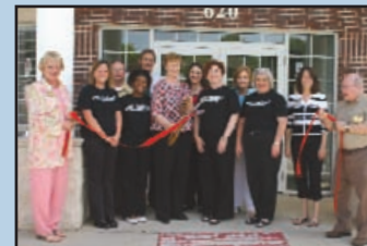
TELCO PLUS CREDIT UNION 620 W. Front Tyler, Texas 75702 • 903-597-4321