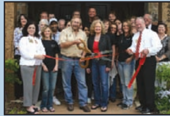
COYOTE SAM'S RESTAURANT 5424 Old Jacksonville Road Tyler, Texas 75701 • 903-509-4222