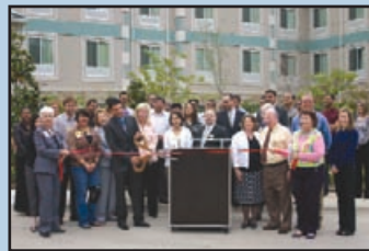
HILTON GARDEN INN 220 East Grande Tyler, Texas 75703 • 903-509-1166