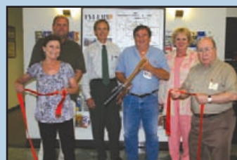
TCS AIR CONDITIONING 213 CR 3527 Bullard, Texas 75757 • 903-506-1503