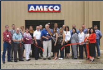
AMECO 635 East NE Loop 323 Tyler, Texas 75706 • 903-593-7493