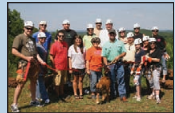
NEW YORK TEXAS ZIPLINE ADVENTURES 7290 CR 4328 LaRue, Texas 75782 • 903-681-3791