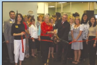
STYLE SALON & DAY SPA 2301 S. Broadway Suite B6 Tyler, Texas 75701 • 903-504-5625