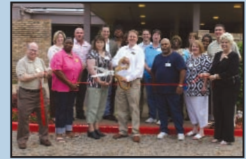
GREENBRIER NURSING AND REHABILITATION CENTER 3526 W. Erwin Tyler, Tx 75701 • 903-593-6441