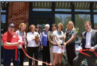
HAUTE DOG 414 S. Broadway Tyler, Texas 75701 • 210-663-6277