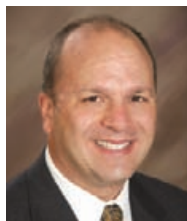
SKIP OGLE SUDDENLINK