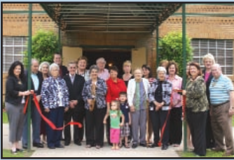
CEDARS OF LEBANON 5800 New Copeland Road Tyler, Texas 75701 • 903-561-3646