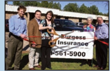
BURGESS INSURANCE 7524 S Broadway Ste 113 Tyler, TX 75703 • 903-561-5900