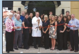
FIORE TUSCAN GRILL 5617 S. Donnybrook Tyler, Texas 75703 • 903-581-7248