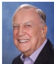
ED KING CHICK-FIL-A