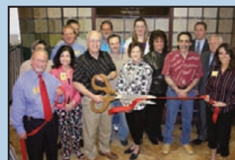
WHITEHOUSE FLOORS AND MORE 308 N. Highway 110 Whitehouse, Texas 75791 903-839-4203