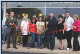
SHEAR DECADENCE HAIR SALON 1427 S. Fleishel Tyler Texas 75701 • 903-526-5565