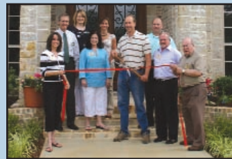
JOHNSON HUMPHREY HOMES 250 Saddle / Creek Tyler, Texas 75703 • 903-839-2889