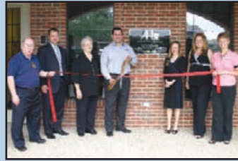
AMERICAN HEARING LABS 455 Rice Rd., Ste. 106 Tyler, Texas 75703 • 903-509-4327