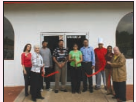
NAMASTE BOMBAY 713 WSW Loop 323, Ste. F • Tyler, Texas 75701 903-561-7200