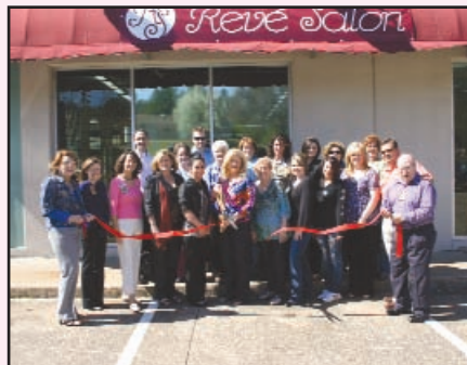
REVE SALON 4719 Troup Highway • Tyler, Texas 75703 903-581-1775