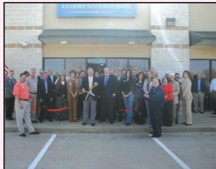
KILGORE NATIONAL BANK 16637 Old Jacksonville Hwy • Tyler, Texas 75703 903-509-3600