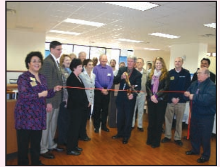
CARTER BLOODCARE – DONOR CENTER 815 Baxter • Tyler, Texas 75701 903-535-5400