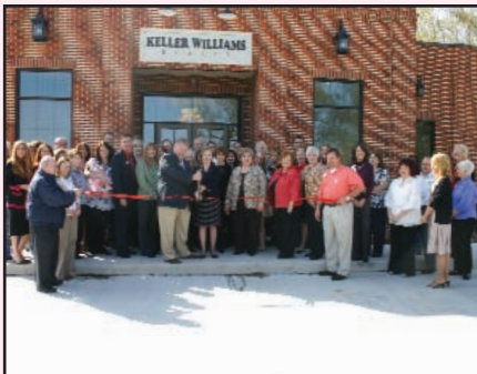
KELLER WILLIAMS REALTY 6761 Old Jacksonville Hwy • Tyler, Texas 75703 903-534-6624