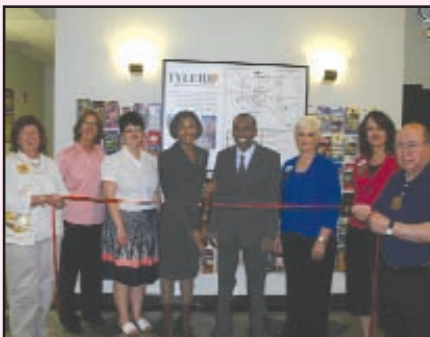
PENNYPAYS INDEPENDENT BUSINESS CONSULTING FIRM 903-705-0120