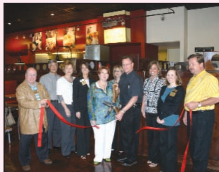
THE DINER 7924 S. Broadway • Tyler, Texas 75703 903-509-3463