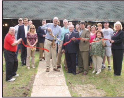
AZLEWAY BOY'S RANCH 15892 County Rd. 26 • Tyler, Texas 75707 903-566-8444, ext. 212