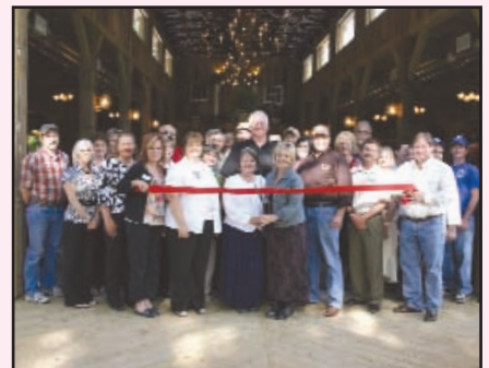
STONE OAK RANCH, LLC 10204 County Road 3807 • Murchison, Texas 75778 903-530-7947