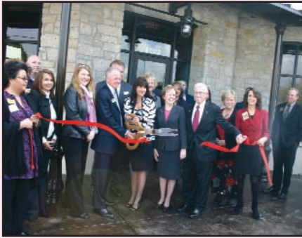
AMERICAN STATE BANK 5202 Old Jacksonville • Tyler, Texas 75703 903-266-5525