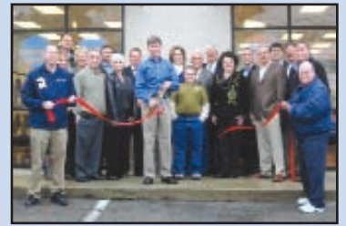
WASH SMART LAUNDRY 3101 Shiloh Rd. #125 • Tyler, Texas 75707 903-521-5829