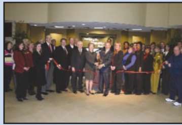
TEXAS BANK AND TRUST 2323 W. Grande • Tyler, Texas 75703 903-579-8100