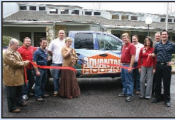
ADVANTAGE ROOFING 3601 Old Bullard Rd., Ste. 102A Tyler, Texas 75701 • 903-939-3168