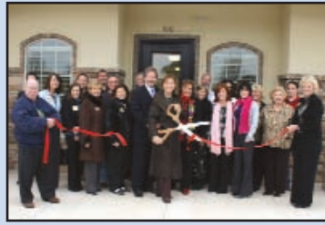
PAMELA WALTERS GROUP 1406 Rice Road, Ste. 100 • Tyler, Texas 75703 903-581-3900