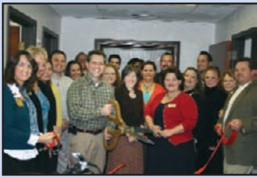
RIGHT AT HOME 3800 Paluxy, Ste. 230 • Tyler, Texas 75703 903-705-7218