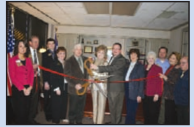
PINEY WOODS REGIONAL ADVISORY COUNCIL 100 East Ferguson St., Ste. 910 Tyler, Texas 75702