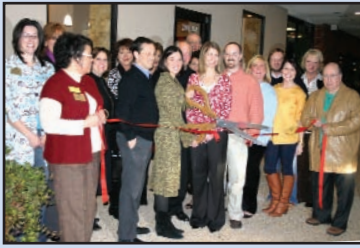
NATURAL HEALTH FAMILY CHIROPRACTIC 2301 S. Broadway, Ste. B-5 Tyler, Texas 75701 • 903-617-6110