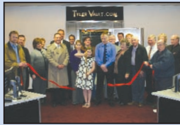
TYLER VAULT 110 N. College Ave., LL024 Tyler, Texas 75702 • 903-266-9225