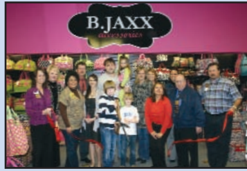
B. JAXX HANDBAGS & ACCESSORIES 4023 S. Broadway • Tyler, Texas 75701 903-561-2250