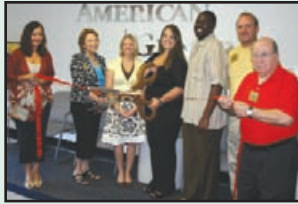
AMERICAN GENERAL FINANCE 1700 S SE Loop 323, Ste 320 903-566-7900