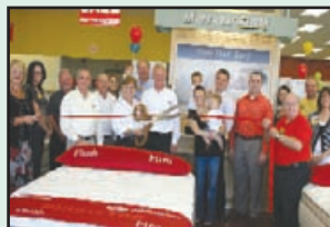
MATTRESS FIRM 6900 S. Broadway 903-509-2337