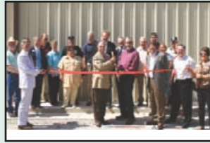
AZLEWAY INC 15892 CR 26 75707 903-566-8444