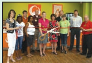
ORANGE LEAF 3979 Old Jacksonville Hwy Tyler TX 903-939-0510