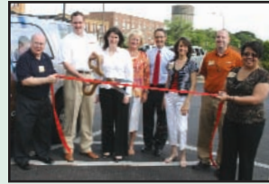
CERTAPRO PAINTERS 903-597-7800