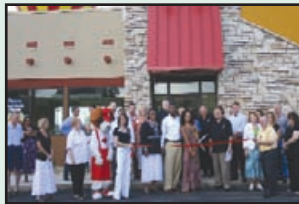
TACO BUENO 5316 Old Bullard Rd. 566-4900