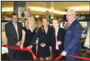
DILLARDS KIEHLS 4601 S. Broadway Tyler Tx 75703 903-561-1221