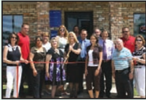
AAA FRIENDLY STORAGE 12324 HWY 155 S 903-509-4444