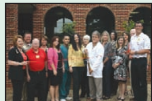
QUANTUM HEALING INSTITUTE 212 Old Grande Blvd, Suite C114 903-939-2069