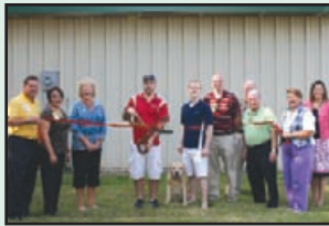
EAST TEXAS ARCHERY 12573 Hwy 31 West 903-939-0693