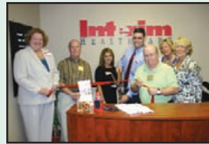
INTERIM HEALTHCARE OF EAST TEXAS 1021 ESE Loop 323, Suite 300 903-705-4780