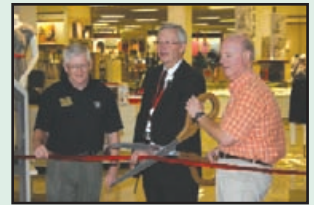
JCPENNEY 4401 S. Broadway Tyler Tx 75703 903-561-3333