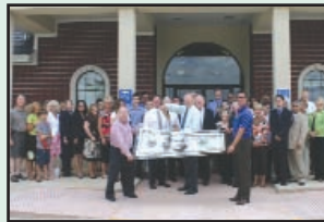
TEXAS BANK 1501 Rhones Quarter Rd. 903-504-5191