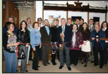
FITZPATRICK ARCHITECTS 1510 S Vine Ave • 903-592-0728