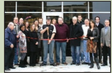
WINGSTOP 7484 S Broadway • 903-561-0860