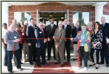
MEADOW LAKE – A SENIOR LIVING COMMUNITY 16044 County Road 165 • 903-526-5599