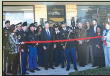
US ARMY TYLER RECRUITING COMPANY 4750 S Broadway • 903-584-0913