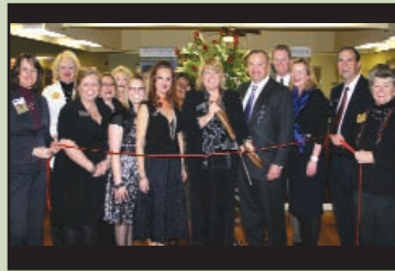
THE HEIGHTS OF TYLER 2650 Ekilton Trail • 903-266-7200