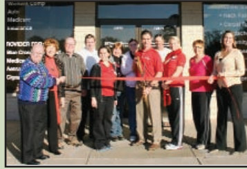
HEALTHSOURCE OF SOUTH TYLER 10678 FM 346 W, Flint • 903-894-4599