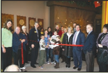
DISCOVERY SCIENCE PLACE 308 N Broadway • 903-533-8011