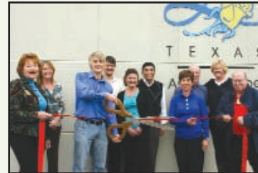
TRAVIS J. CONSULTING 903-258-3950