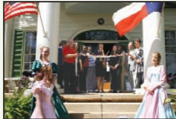
THE 1859 GOODMAN-LEGRAND HOUSE & MUSEUM 624 N Broadway • 903-531-1286