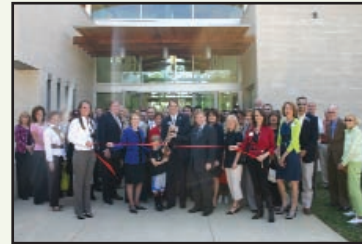
GREATER TYLER ASSOCIATION OF REALTORS 2772 SSE Loop 323 • 903-561-8403