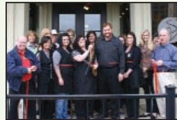
SALON VERVE 121 E Erwin • 903-617-6901