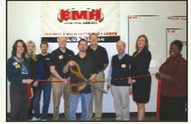
EMH GRAPHIC DESIGN 4704 Candy Lane, Ste 300 • 903-939-2980