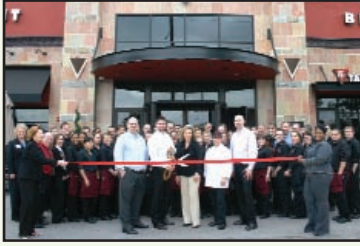
BJ'S RESTAURANT AND BREWHOUSE 210 WSW Loop 323 • 903-939-2840