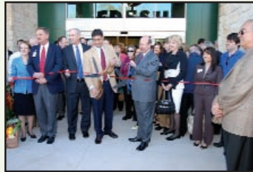
FRESH BY BROOKSHIRES 6991 Old Jacksonville Hwy • 903-747-3503