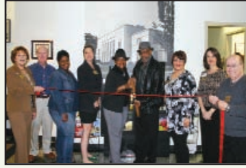
EAST TEXAS PROMOTIONS UNLIMITED 951-314-1910