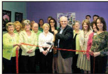
LEARNINGRX 3200 Troup Highway Suite 250 • 903-617-6899