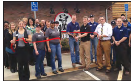
SLIM CHICKENS 7925 S. Broadway, Suite 100, Tyler 903-561-7546