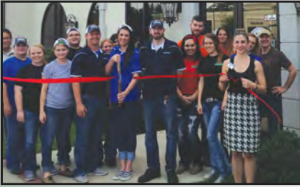
GUSANOS CHICAGO STYLE PIZZERIA 7278 Old Jacksonville Highway, Suite 300, Tyler 903-630-7274