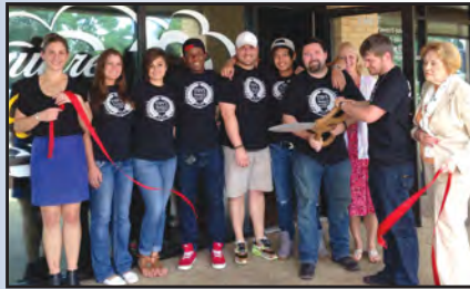
TOWN SQUARE VAPE LAB 5201 S. Broadway, Suite 190, Tyler 903-787-8506