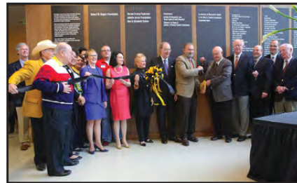
TYLER JUNIOR COLLEGE – ROBERT M ROGERS NURSING AND HEALTH SCIENCES CENTER, MAIN CAMPUS Fifth & Fleishel, Tyler 903-279-7278