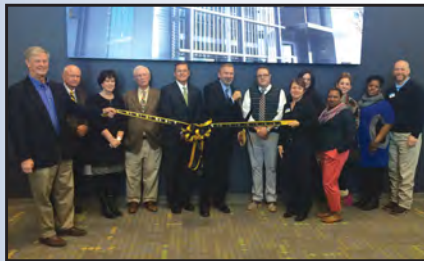
TYLER JUNIOR COLLEGE – NEW ENERGY CENTER WEST CAMPUS 1530 SSW Loop 323, Tyler 903-279-7278