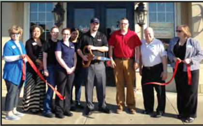
NEWK'S EXPRESS CAFÉ 3985 Old Jacksonville Hwy., Tyler 903-509-4646