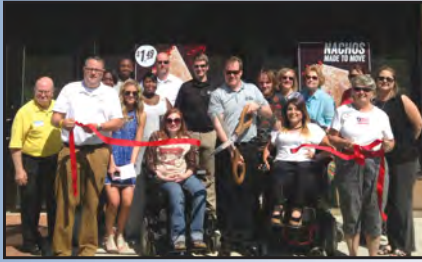
TACO BELL 5978 Old Jacksonville Hwy., Tyler 903-330-3105