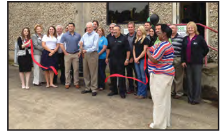
O'ROURKE PETROLEUM 510 N. Palace Ave., Tyler 713-806-9269