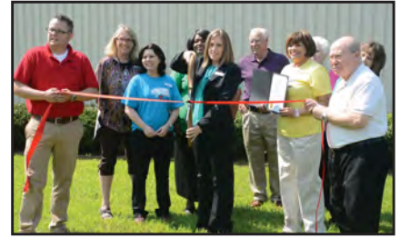
THE ALMOND TREE 201 Winchester Drive, Tyler 903-330-5664