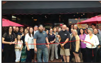
LOLA'S 16700 Old Jacksonville Highway, Tyler 903-707-2432