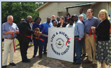
WINNERS CIRCLE OF TYLER 1505 Texas College Road, Tyler 903-780-5456