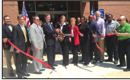
TEXAS DEPARTMENT OF STATE HEALTH SERVICES 2521 West Front Street, Tyler 903-533-5361