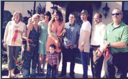
THE FAIREST SALON Swann Plaza • 7270 Old Jacksonville, Tyler 903-574-2361