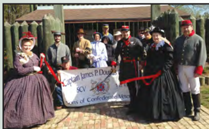
SONS OF CONFEDERATE VETERANS CAPT. JAMES P. DOUGLAS CAMP 124, CAMP FORD HISTORIC PARK 6500 US Highway 271, Tyler 903-725-6774