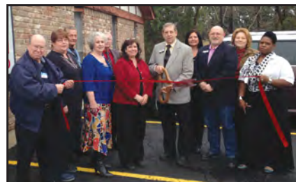
WORTHEN REALTY GROUP 2001 Rickety Ln, Tyler 903-581-4614