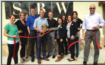
SHERMAN BRISCOE WILKINSON ORTHODONTICS 6820 Oak Hill Blvd., Tyler 903-597-6372