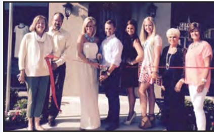
THE LOFT BOUTIQUE TYLER Swann Plaza • 7270 Old Jacksonville, Tyler 903-316-6306