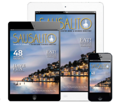
TABLET & SMARTPHONES