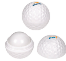
Golf Ball Lip Balm; min qty 175, $400