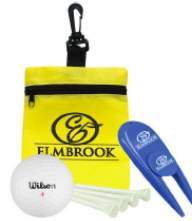
Golf-In-Bag-Set; min qty 175, $710