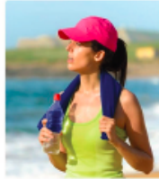
Cooling Towel; min qty 175, $500