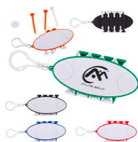
Golf Tool Set Key Tag; min qty 200, $325