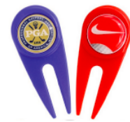
Golf Divot Tool W/ Marker; min qty 175, $405