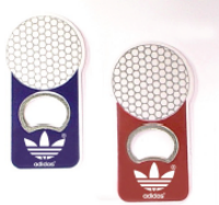
Golf Ball Magnetic Bottle Opener; min qty 175, $300

*NEW* - We're RAISING THE BAR on our goody bags to give our golfers what they really want - fun, usable golf items! AND we'll help you get your logo on it. Items with "X" have already been claimed. Prices include all fees/shipping/taxes: