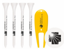
4 Tees/1 Divot/1 PWN; min qty 250, $395