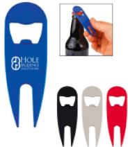
Divot Tool With Bottle Opener; min qty 250, $340