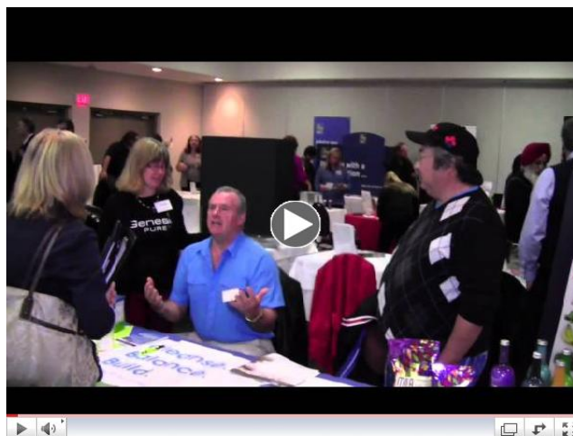
Duncan Chamber of Commerce Business Expo 2014, British Columbia