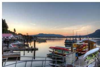
View from Cow Cafe deck