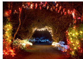
Milner Gardens Holidays

Stroll the Magic of Christmas at Milner Gardens. Christmas displays are open Dec. 4 - 6, Dec. 11 - 13, and then Dec. 16 through to Dec. 20. Opening hours are the same each day: 5 - 8:30 pm. There is more than half a kilometre of lit, decorated trails with Christmas light shows the whole family will enjoy. Santa will also be on site, along with live Christmas music, the Teddy Bear Cottage, Storytelling, Refreshments and the Tearoom. There is an onsite shuttle for mobility challenged. We suggest you bring a flashlight.