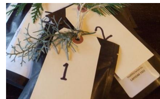
Teafarm Advent Calendar

You are invited to Teafarm's 10th annual open house Friday+Saturday+Sunday December 4+5+6 from 10 am - 6 pm. Share the warmth of the season by the wood stove as you enjoy complimentary teas and delectable sweets. It is Teafarm's way of saying thank you for your wonderful support past and present. Bring a friend to experience Teafarm. And if you are far away and can't make it... we will have a sip and a sweet for you! Relax and take your time to find the perfect gift or enjoy shopping online from our selection of unique gift sets .