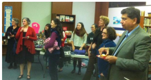
Learning more about Dwight School Canada