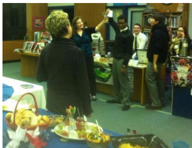
Drawing for prize Cowichan sweater