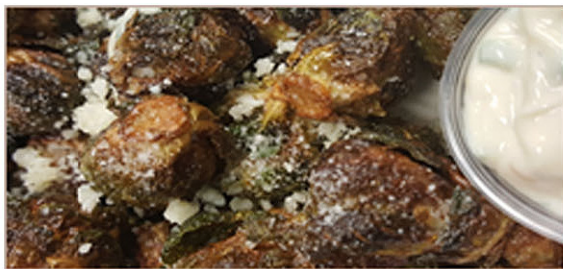
Crispy Brussel Sprouts

Baked Stuffed Portabella: Spinach, Gorgonzola & Chorizo Stuffing