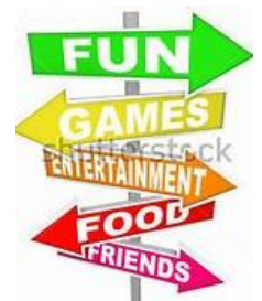
fun & games