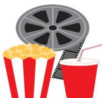
popcorn drink & a movie