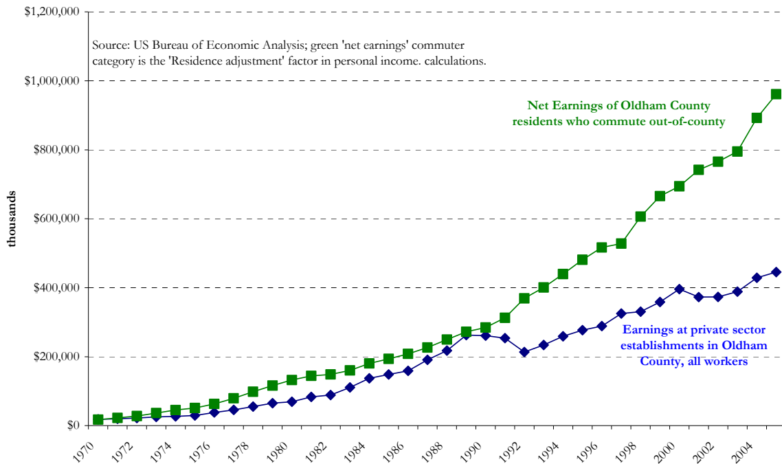
Earnings by Place of Work and Place of Residence, Oldham County 1970 to 2005

Another interesting, and very relevant, historical observation is that private sector job growth in Oldham County has been dominated by low-paying, part-time, work. Whereas in 1990 private sector and public sector employees earned essentially the same annual wages and salaries, by 2005 government workers earned fifty percent more than those in the private sector. Specifically, the average annual earnings of workers in Oldham County in 2005 were $30,465; but government workers averaged $43,162, while private sector workers earned $28,719. Over one-half of the government employment is accounted for by local government, and the largest component is the public school teachers and staff. The average pay of the 758 certified teachers and staff in the Oldham County Public School system is $45,000 2 . Additionally, there are nearly 1,400 state government workers in the County, including those at the Reformatory, and their pay