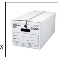
2.4 cu. ft. file box