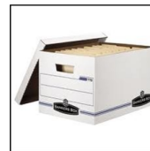
1.2 cu.ft. banker box