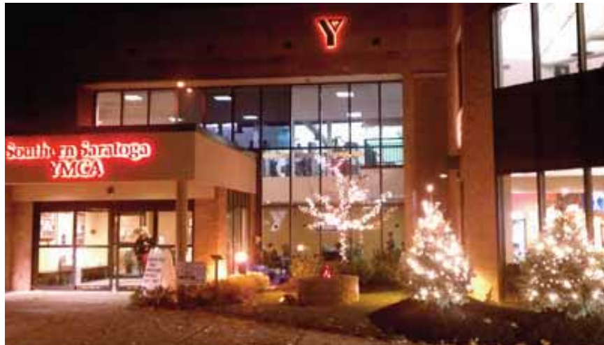
The entrance of the Southern Saratoga YMCA glows the evening of the Expo thanks to the landscaping design and lights by Blue Spruce Nursery.