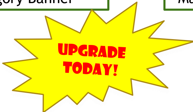
Side Bar Advertising