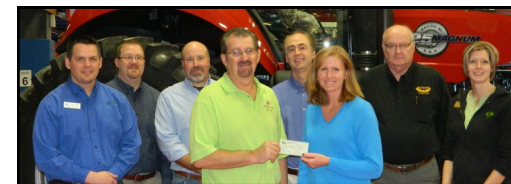
Members of the Agri-Business Committee made a donation to Whiteside County's Ag in the Classroom program (above) and to the Whiteside County 4-H Program (below).