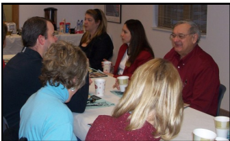
January 2010 Breakfast before Business

Sponsorships, advertising, volunteering and participating in networking programs like Breakfast before Business or Business after Hours the Chamber is helping create new marketing opportunities to help members find new customers.