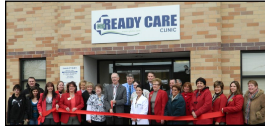
Ribbon Cutting for CGH Medical Center Ready Care Clinic (above)

In fiscal year 2012, 24 new members joined the Sauk Valley Area Chamber of Commerce and Chamber Ambassadors held 19 ribbon cuttings.