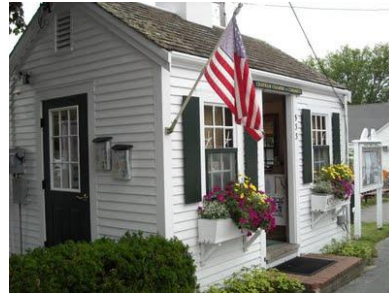
Information Booth on Main Street