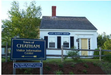
Capt. Bassett House Visitor Center

The chamber operates two visitor centers for the benefit of its members and the Town of Chatham. The main year-round visitor center is located in the Capt. Bassett House located at 2377 Main Street in South Chatham. The Information Booth is open seasonally and is located in the center of the town at 533 Main Street.