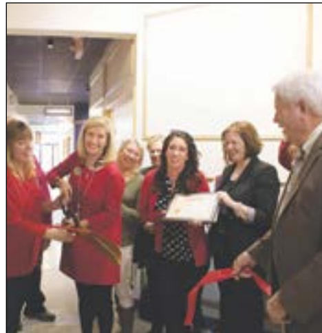
Congratulations Keller Williams on your new location in the Bright Center in Old Town.

GOLDEN SEAL ENTERPRISES SECURITY • INVESTIGATION • TRAINING