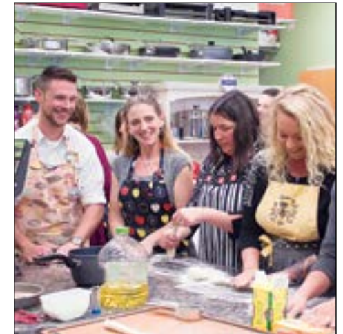
Young Professionals Group making pretzels during their mixer at Nibblins.