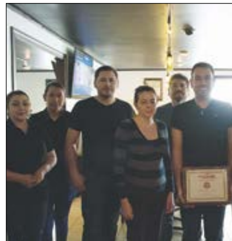
Congratulations to Taqueria Guadalajara on celebrating their 1 year anniversary!