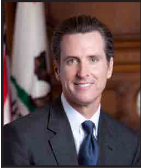
Lieutenant Governor Democratic Representative

Jerry Brown State Capitol Suite 1173 Sacramento, CA 95814 916.445.2841 gov.ca.gov