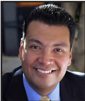
Secretary of State Democratic Representative

Xavier Becerra Attorney General's Office California Department of Justice Sacramento, CA 94244 916.322-3360 oag.ca.gov