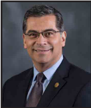
Attorney General Democratic Representative

Gavin Newsom State Capitol Suite 1114 Sacramento, CA 95814 916.445.8994 ltg.ca.gov