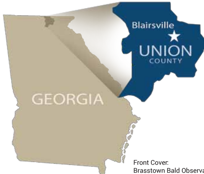
Front Cover: Brasstown Bald Observatory