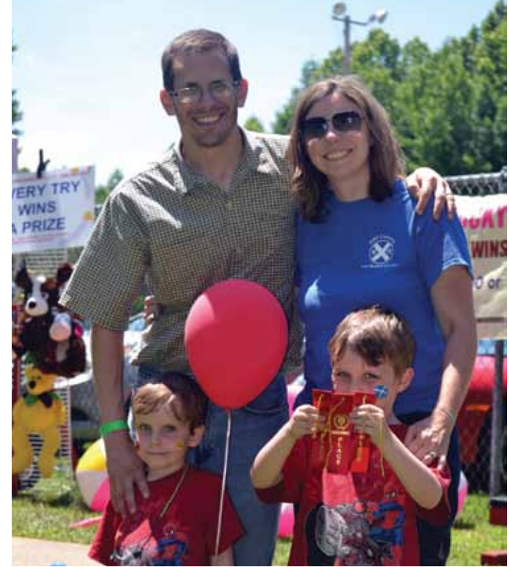
Family fun at one of our area festivals