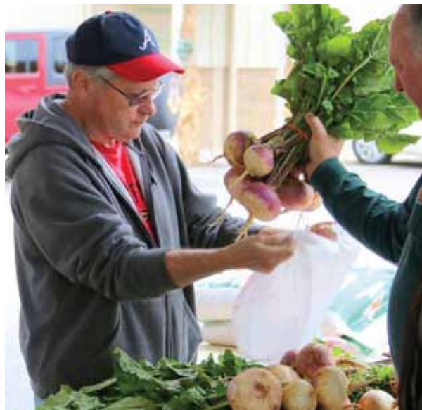
Farmers Market