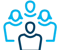
Loyalty Solutions & Merchant Cash Advance

Tailored Solutions to grow and manage your business one transaction at a time.