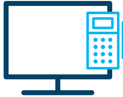
Integrated POS Solutions