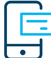
Mobile & Tablet Solutions