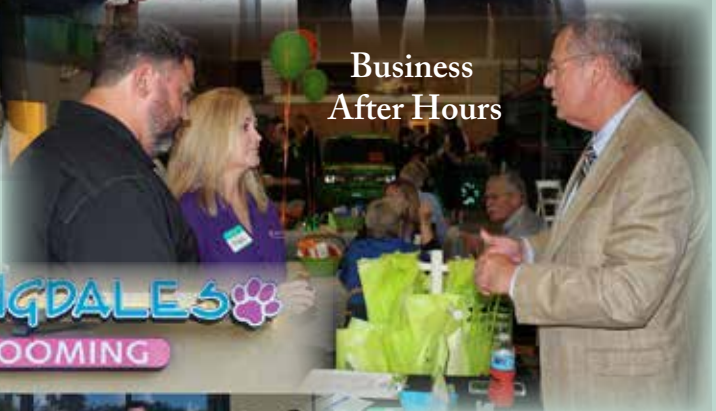
Business After Hours