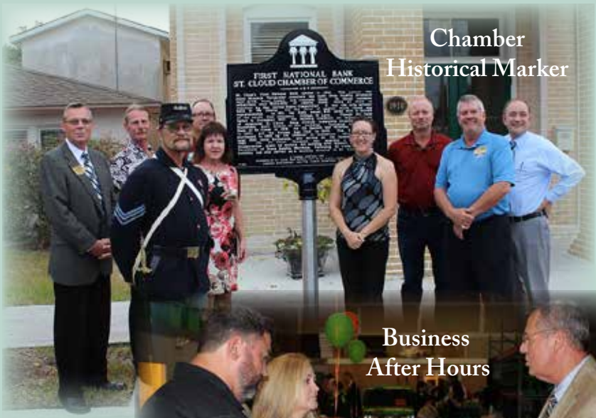
Chamber Historical Marker