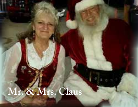
Mr. & Mrs. Claus