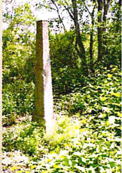
A high water marker from the 1912 flood discovered on the Thrivent Loop of the trail.