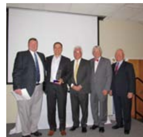
The Greenville Board of Development recognized two local businesses with Community Investment Awards: Triyar Companies, LLC and the Stainback Organization.