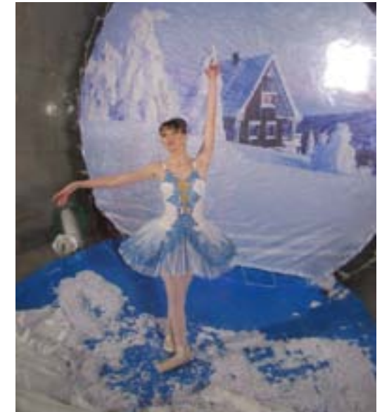
Timbrel School of Dance ballerina welcomed guests in a life-size sno-globe.