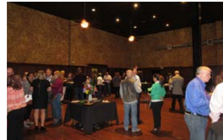
Many Greenville Chamber members were present to network and enjoy Landon Winery!