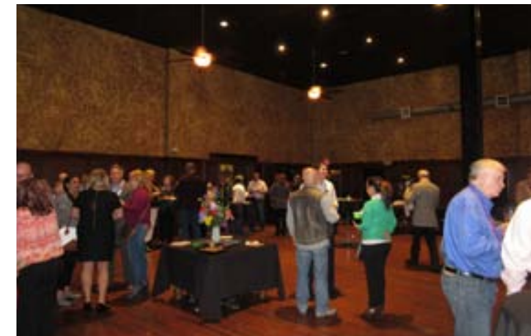
Many Greenville Chamber members were present to network and enjoy Landon Winery!