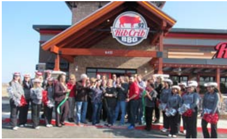
Rib Crib. 6815 I30 Frontage Rd., Greenville. 903.454.2770. www.RibCrib.com