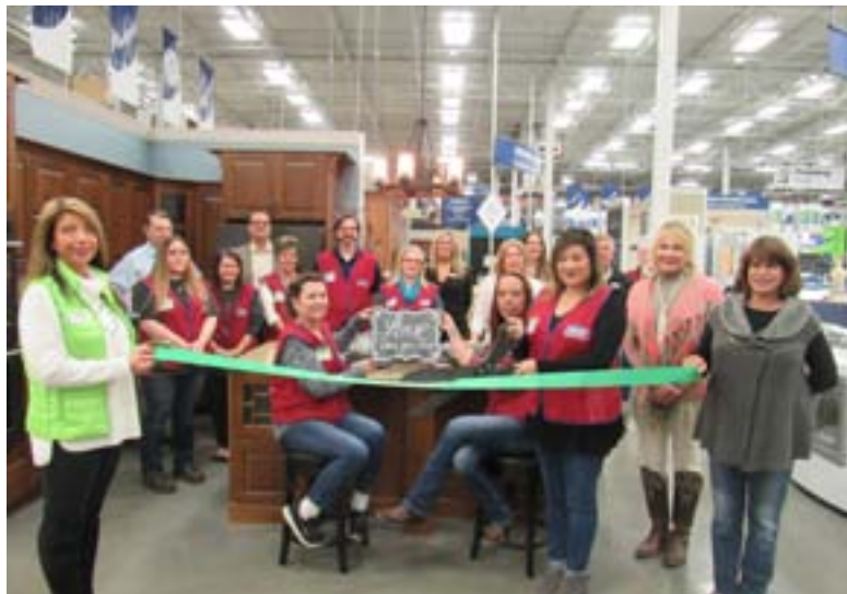
Lowe's. 3122 IH 30 W, Greenville. 903.453.3170.