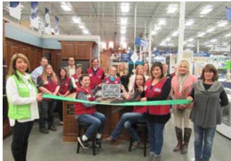
Lowe's. 3122 IH 30 W, Greenville. 903.453.3170.