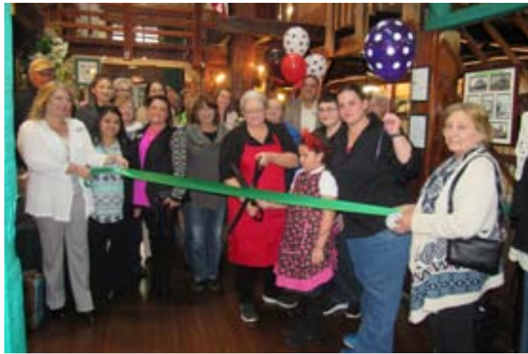
Yaya's Cafe. Uptown Forum, 2610 Lee St., Greenville. 903.268.5127.