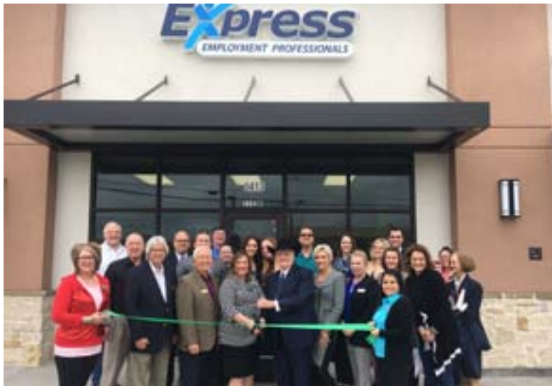
Express Employment Professionals. 6413 Wesley St. Suite B, Greenville. 903.454.2997. www.ExpressPros.com.