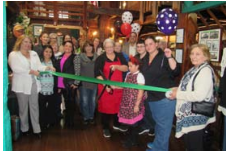
Yaya's Cafe. Uptown Forum, 2610 Lee St., Greenville. 903.268.5127.