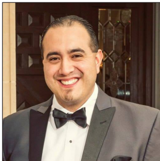
Tony Garcia Chamber Golf Classic Fuzzy's Taco Shop