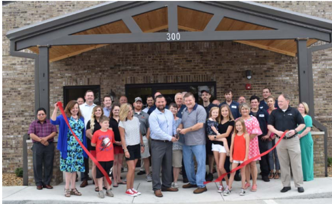
JWH Transport, 300 Booze Mountain Rd, celebrates their business with a Ribbon Cutting Ceremony.