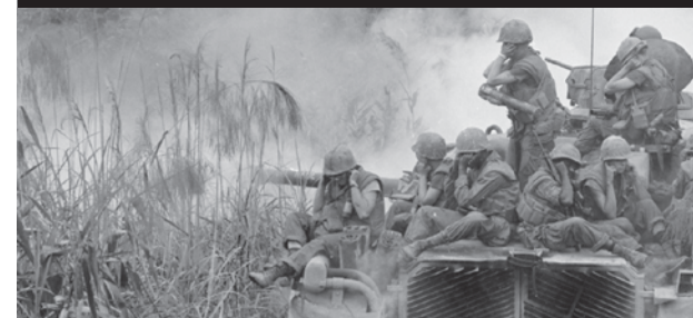
PHOTO SUBMISSION GUIDELINES

Photo of veteran must be in uniform, no exceptions , to be displayed on the banner (all hardcopy photos will be returned).