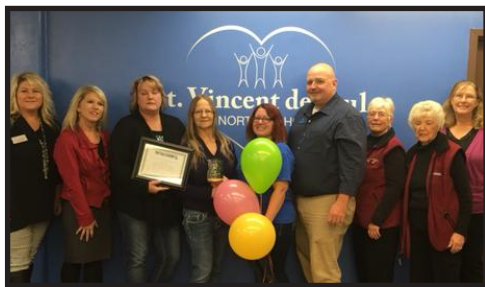
St. Vincent de Paul Members since 2010