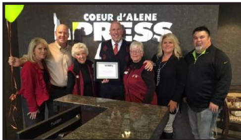
CDA Press Members since 1982

For 70 years St Vincent de Paul North Idaho's focus has been to collaborate with other agencies to provide the best possible services to the suffering in our community. They provide shelter for the homeless, transitional and affordable housing, a HELP center offering a myriad of services, a weekly soup kitchen and winter warming centers. They operate 2 thrift stores to help support their mission.