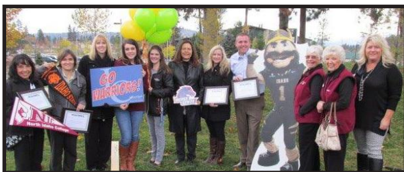
North Idaho College, University Of Idaho, Boise State University, Lewis and Clark State College, Idaho State University

The Press has been serving Kootenai County since 1892. Today it reaches nearly 60,000 readers every day, in print and online. Its production facility in Coeur d'Alene also publishes daily or weekly newspapers for Moses Lake, Sandpoint, St. Maries, the Silver Valley, Priest River and Bonners Ferry.