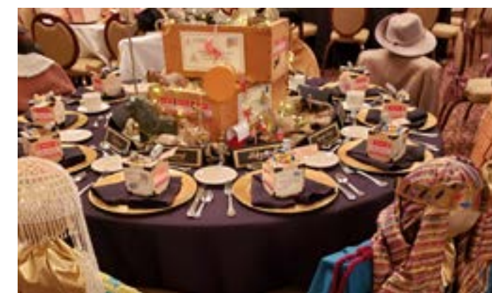
1st Place in the highly competitive Table Decorating Contest was claimed by Walla Walla University.