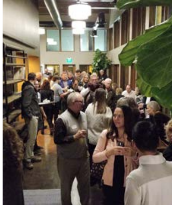
PHOTO GALLERY PHOTOS FROM OUR RECENT EVENTS