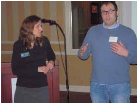
March 2014 Lunch Sponsor, School of Rock