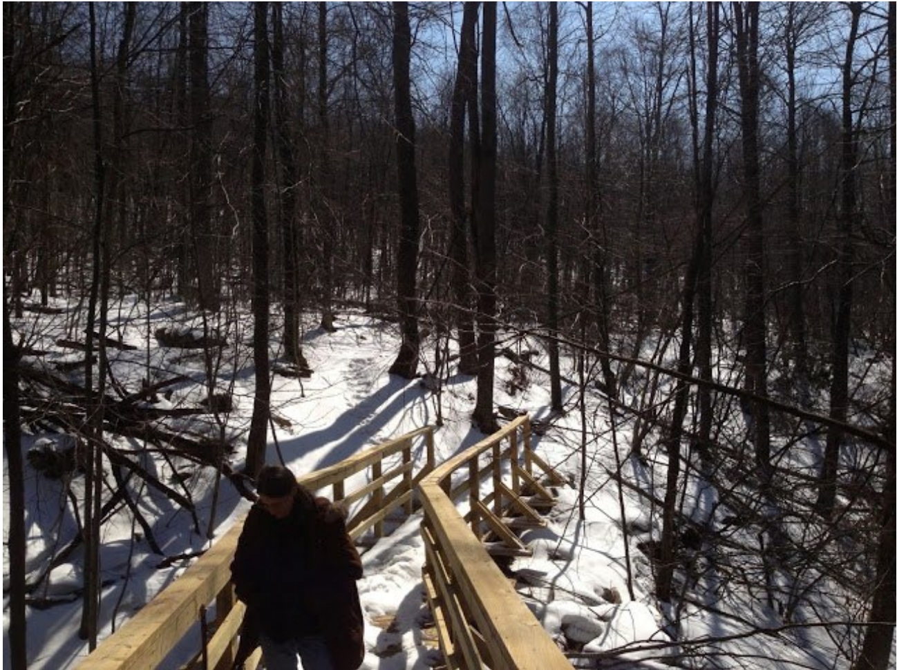
Fork Run Bridge